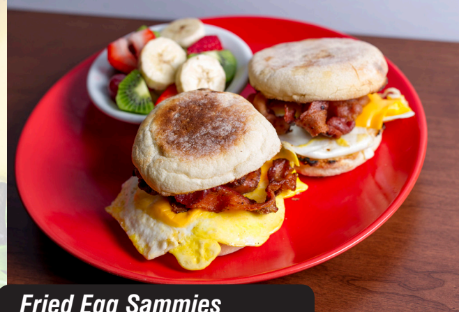
Fried Egg Sammies