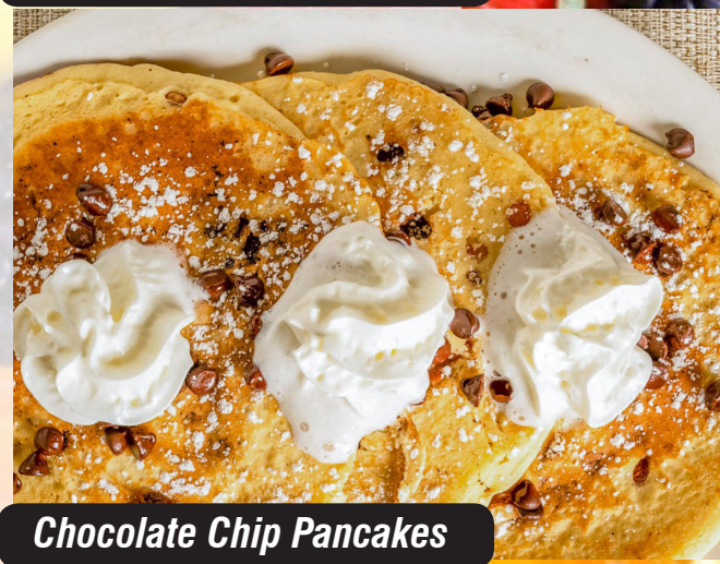
Chocolate Chip Pancakes