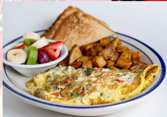
Make Your Own Omelette