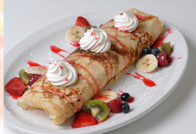
Fresh Fruit Crepe