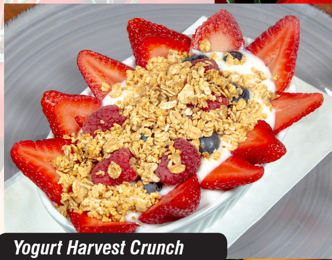
Yogurt Harvest Crunch