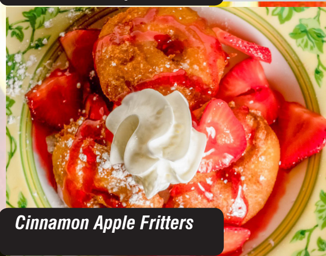
Cinnamon Apple Fritters