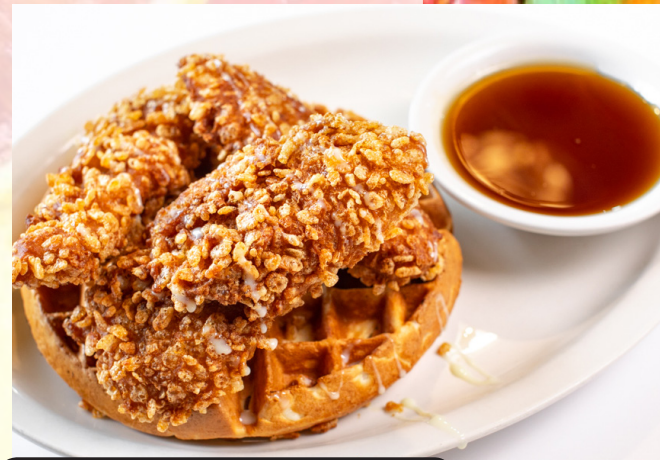
Chicken & Waffles

Served with fresh strawberries and vanilla ice cream..... $7.99