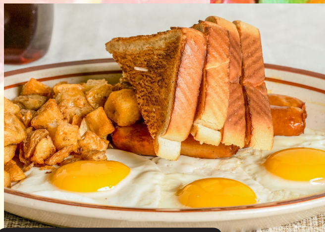
Early Bird All In